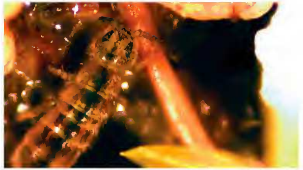
Figure 3: An important food source for small Drosera : Springtails.

We conducted an additional experiment inside our tropical greenhouse (now 18-20°C night, 28-32°C afternoon) to examine the behavior of submerged Drosera traps. Therefore, an 8-cm pot with green and red D. capensis was placed inside a 3-liter plastic tank and slowly submerged with deionized water. We applied two freshly caught houseflies to separate trapping leaves, taking photos after 15, 30, and 60 minutes to document the curling around the prey underwater, and once within 24 hours during the next four days. As the flies do not stick to submerged tentacles, their legs were “hooked” into the tentacles and the bodies were once squashed with a forceps to make them immobile as well as to release some body fluid. Both traps folded around the prey in approximately one hour and remained curled for two to four days, thus indicating that even though submerged, a certain amount of body fluid reached the traps. However, this is only possible without current in standing water.